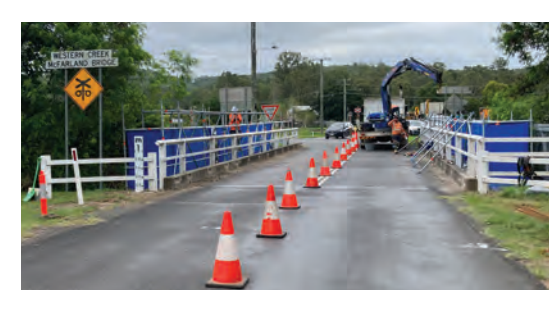
Overview of McFarland bridge with traffic management.

To complete the works Fortec was required to design and construct temporary scaffold to allow access to the side of the bridge and the headstocks. Temporary traffic control and lane closures were put in place during working hours to allow for the completion of the works. This is the first bridge maintenance project completed by Fortec for the Ipswich City Council.