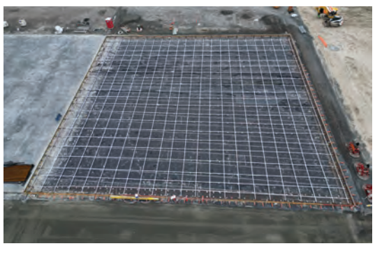
Slab ready for concreting.