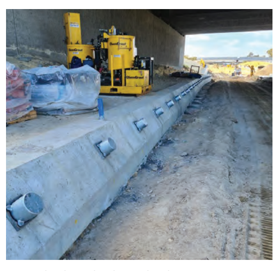
Capped and completed ground anchors.

Drilling for ground anchors under existing bridge.