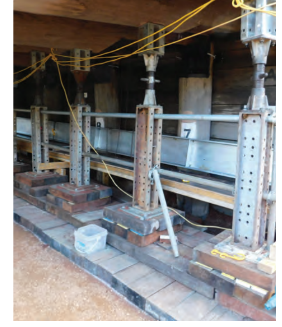
50T props supporting bridge stringers during strengthening work.

Highlights of the project included keeping one lane open at all times and only requiring two concrete pours for the bridge deck.