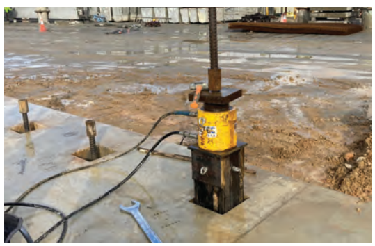
Load testing and stressing.