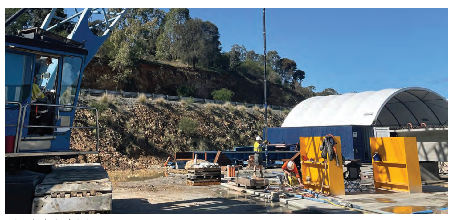
Ground anchor installation by crane.